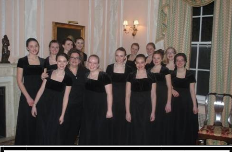
The Singers! Girls * Ages 13-18