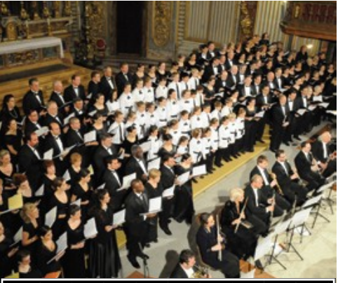
Festivale di Musica e Arte Sacra