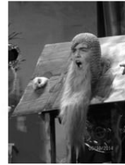
LCJMSM's Production of Shrek The Musical- March 2014

Many characters, many songs, many venues... thank you for the memories. We hope you keep singing !