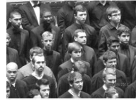
Carnegie Hall -March 2014