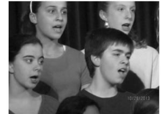
LCJMSM's Bel Canto