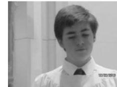
St Teresa's Choir